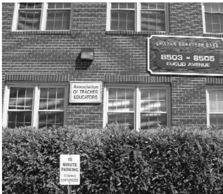
Exterior of ATE's new office in Manassas Park, Virginia